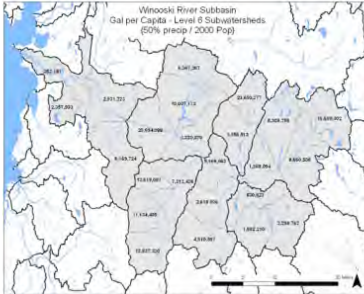
Figure 1c - GIS functionality is then used to determine per capita levels of available renewable water resources per watershed, and/or available resources per level of economic activity – again at the facility/watershed level of analysis.