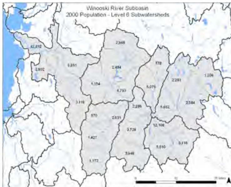
Figure 1b - GIS functionality is also used in combination with census data to determine human populations per watershed.